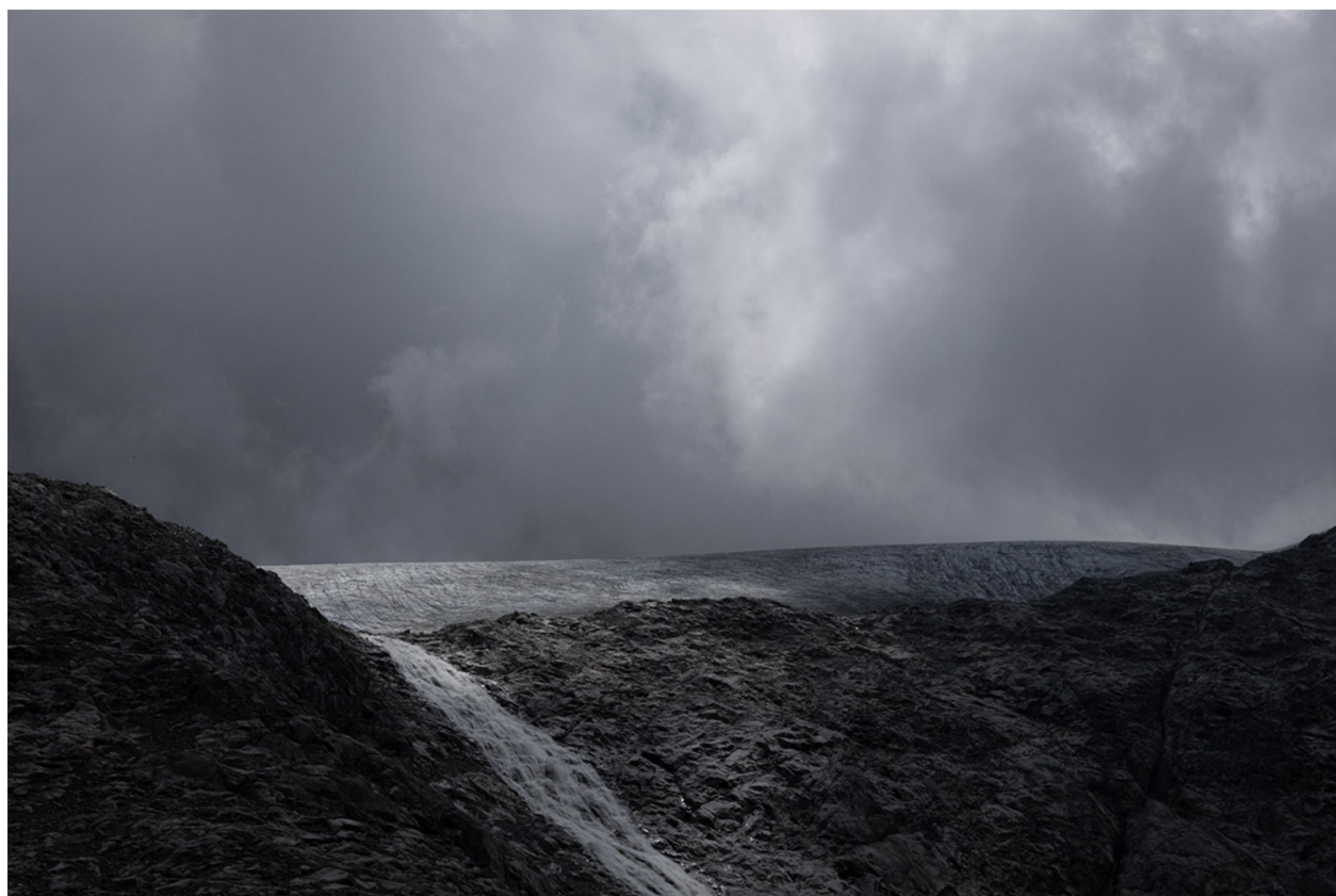
OLIN HEITMANN New Swiss Times , 2022 Inkjet