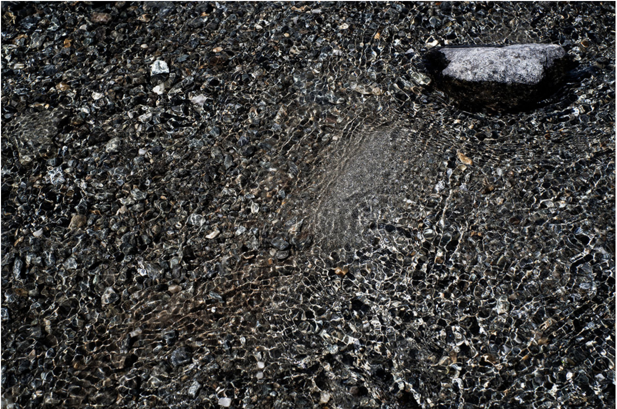
OLIN HEITMANN Divisionism Studies , 2021 Inkjet