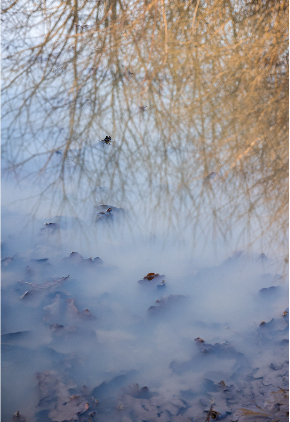
OLIN HEITMANN Los reflejos del carácter , 2022 Inkjet