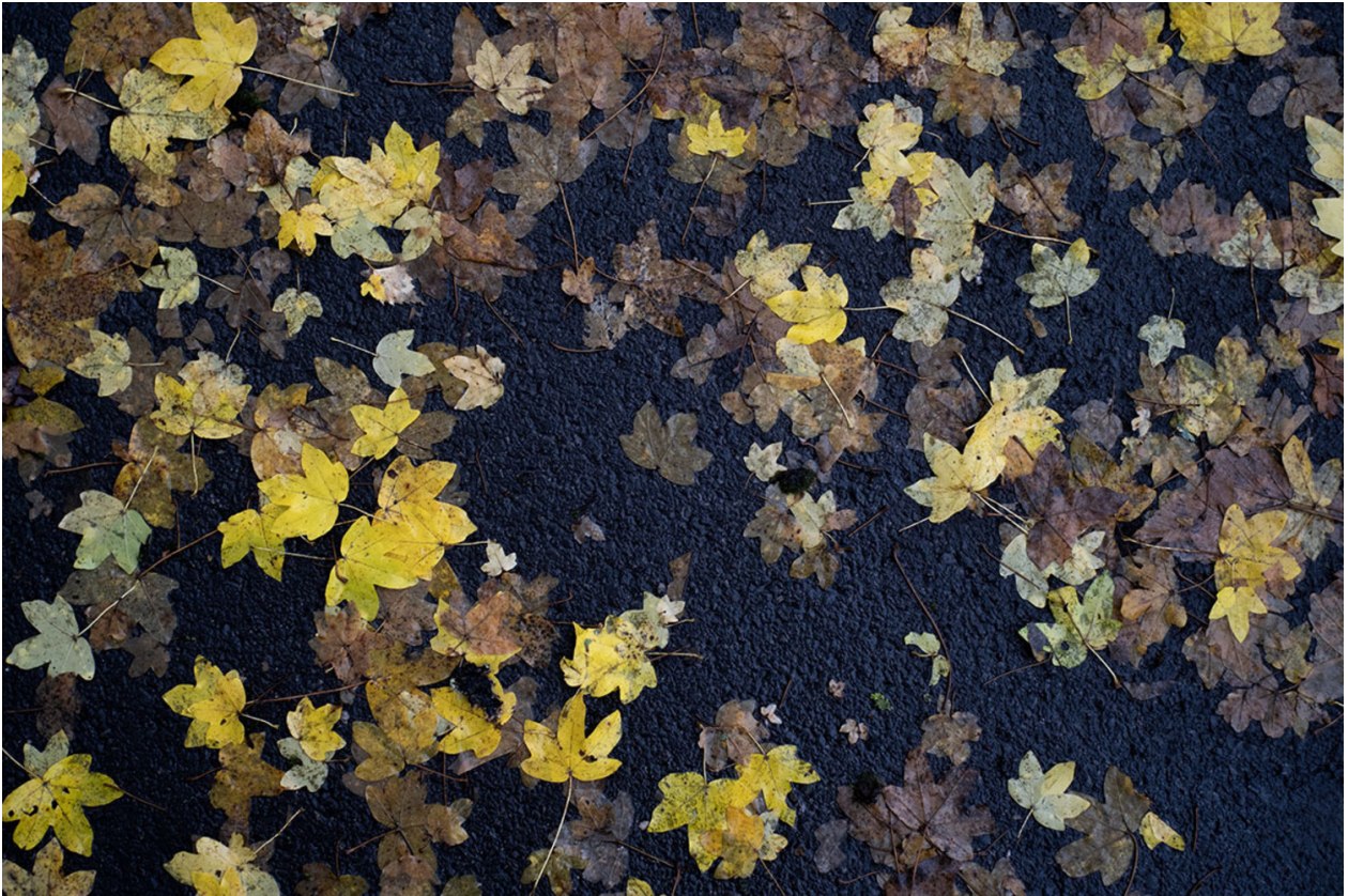
OLIN HEITMANN Fallen , 2021 Inkjet