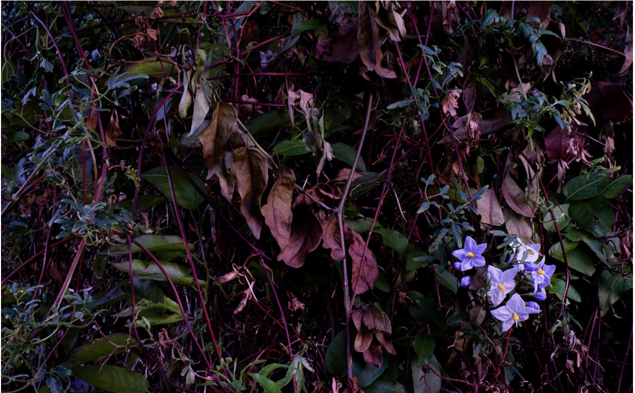
OLIN HEITMANN Autumn Flowers, 2021 Inkjet