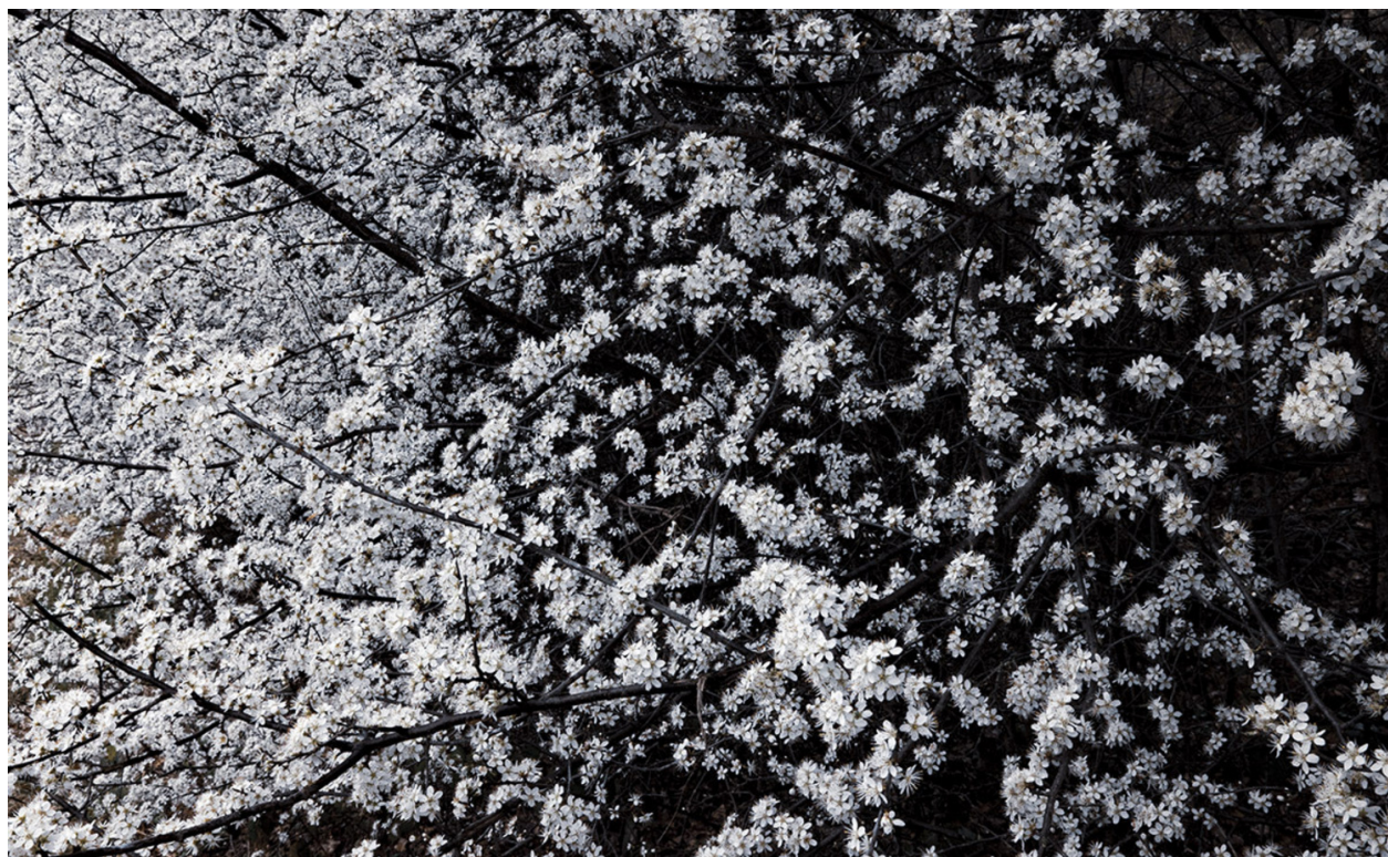
OLIN HEITMANN Monotone Florality , 2022 Inkjet