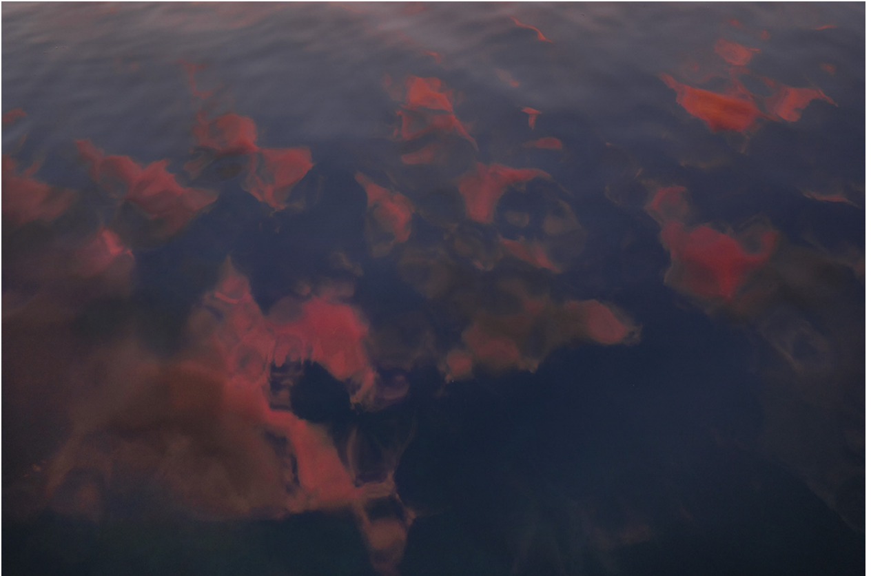
OLIN HEITMANN Knight in the Sky , 2022 Inkjet