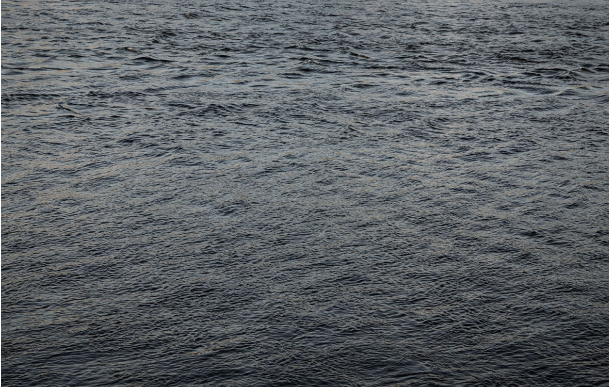
OLIN HEITMANN Summer Night in Porto, 2022 Inkjet