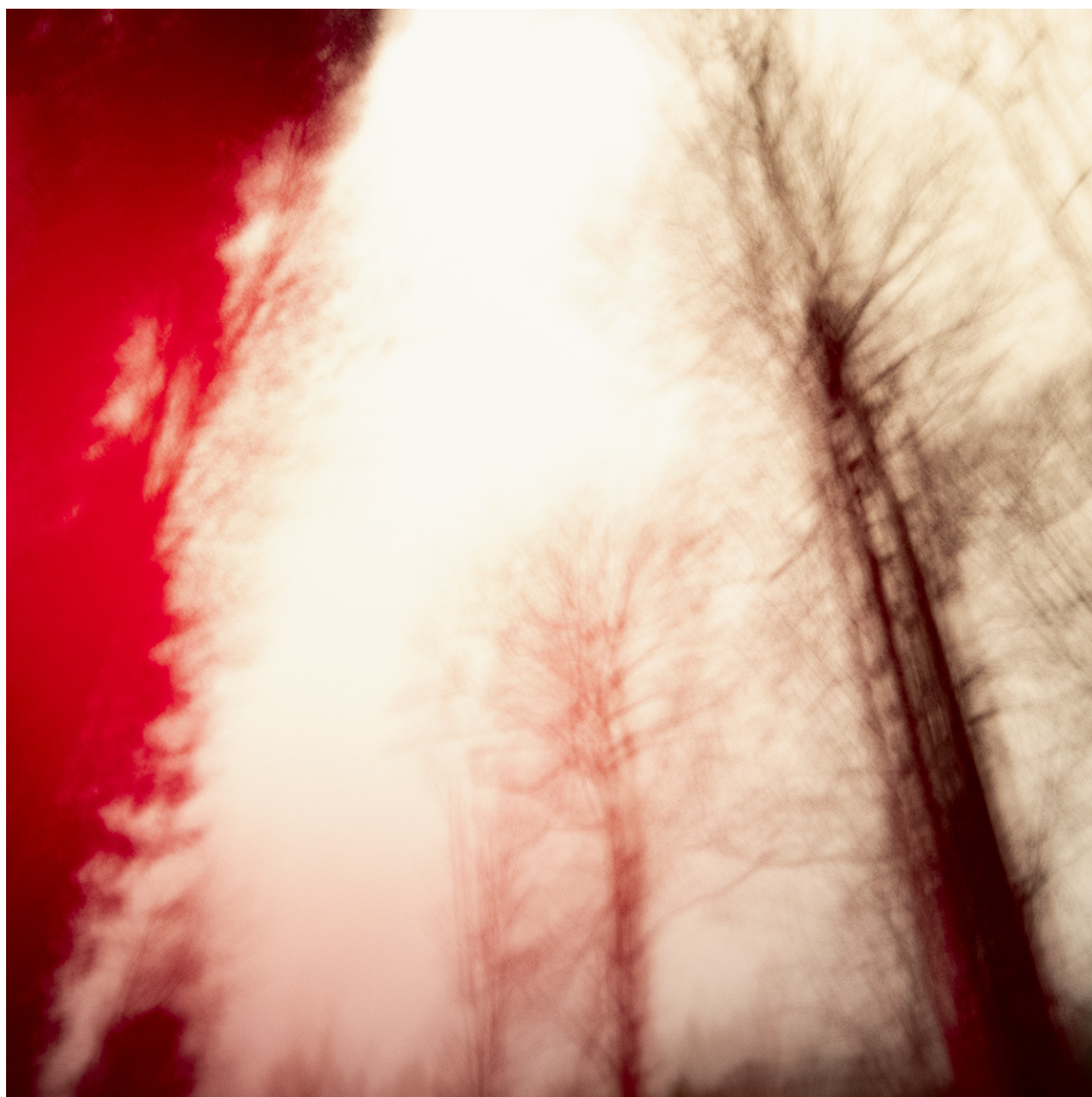
OLIN HEITMANN Blood Moon , 2022 Inkjet