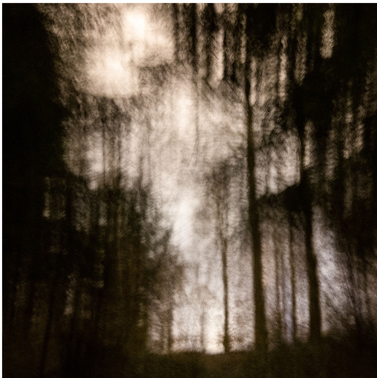
OLIN HEITMANN En la noche camino solo , 2022 Inkjet