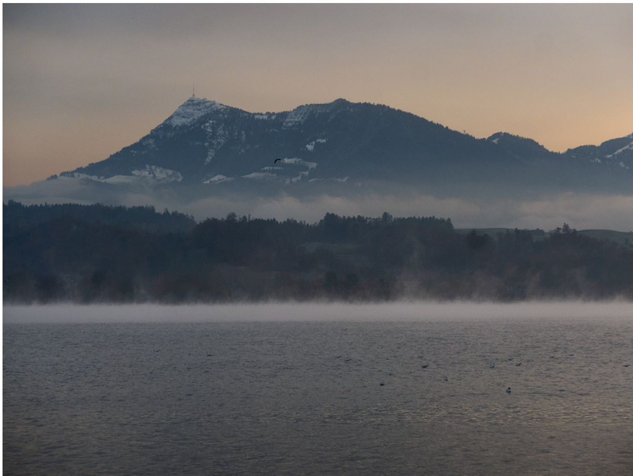
OLIN HEITMANN Turner in Lucerne, 2019 Inkjet