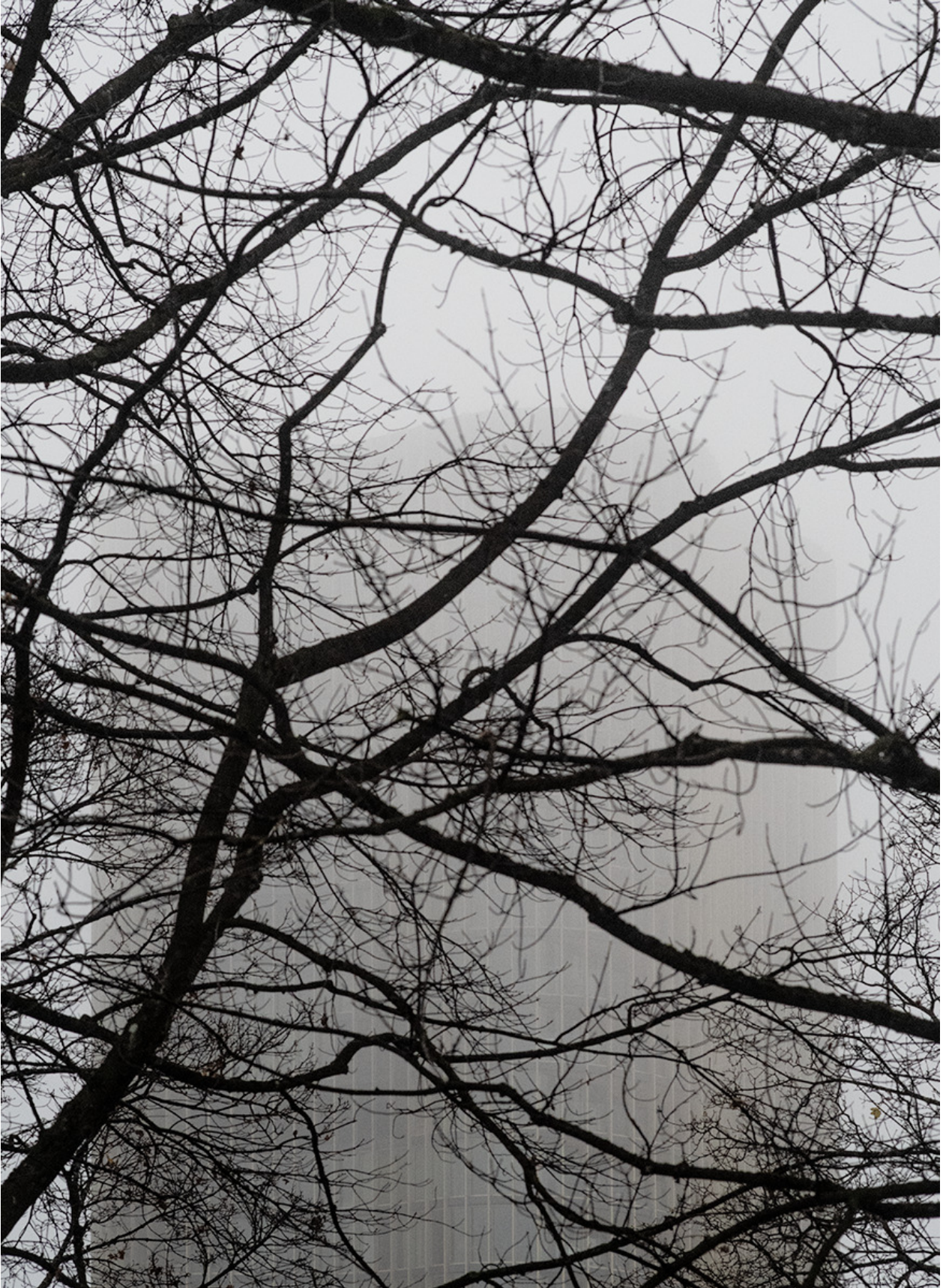
OLIN HEITMANN Platar Fascitis , 2021 Carbon print