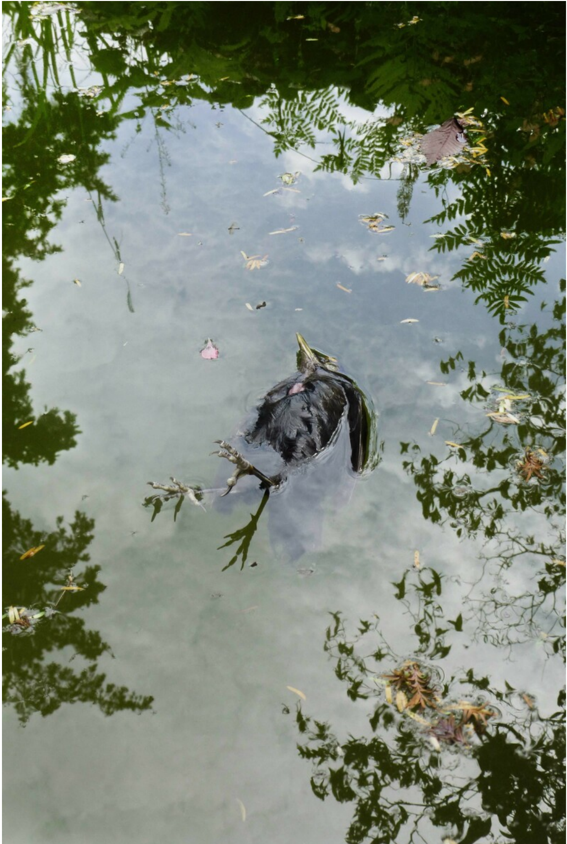
OLIN HEITMANN Requiem color , 2016 Inkjet