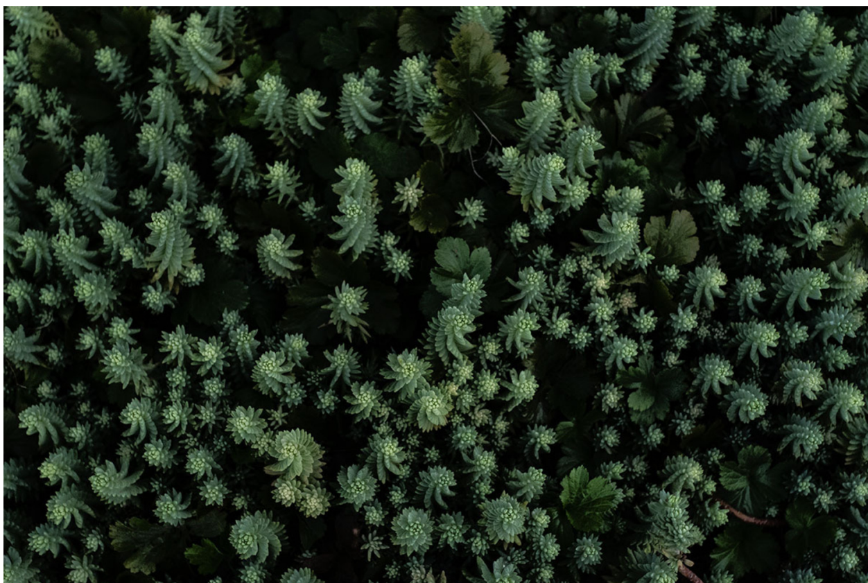
OLIN HEITMANN Fibonacci , 2021 Inkjet